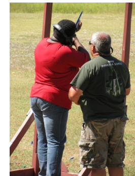
Dewitt's Outdoor Sports