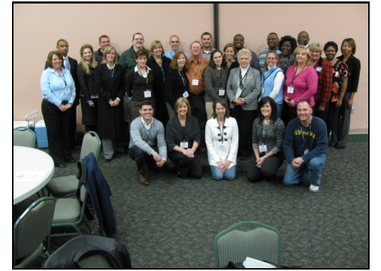
Leadership Richmond Class of 2010